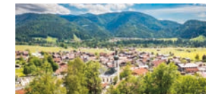
Reit im Winkl