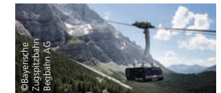
Cable car "Zugspitze"