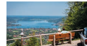
Wallberg Panoramic Road Lake Tegernsee