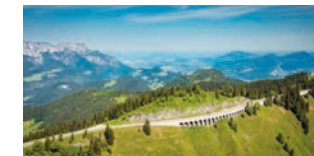
Rossfeld Panoramic Road