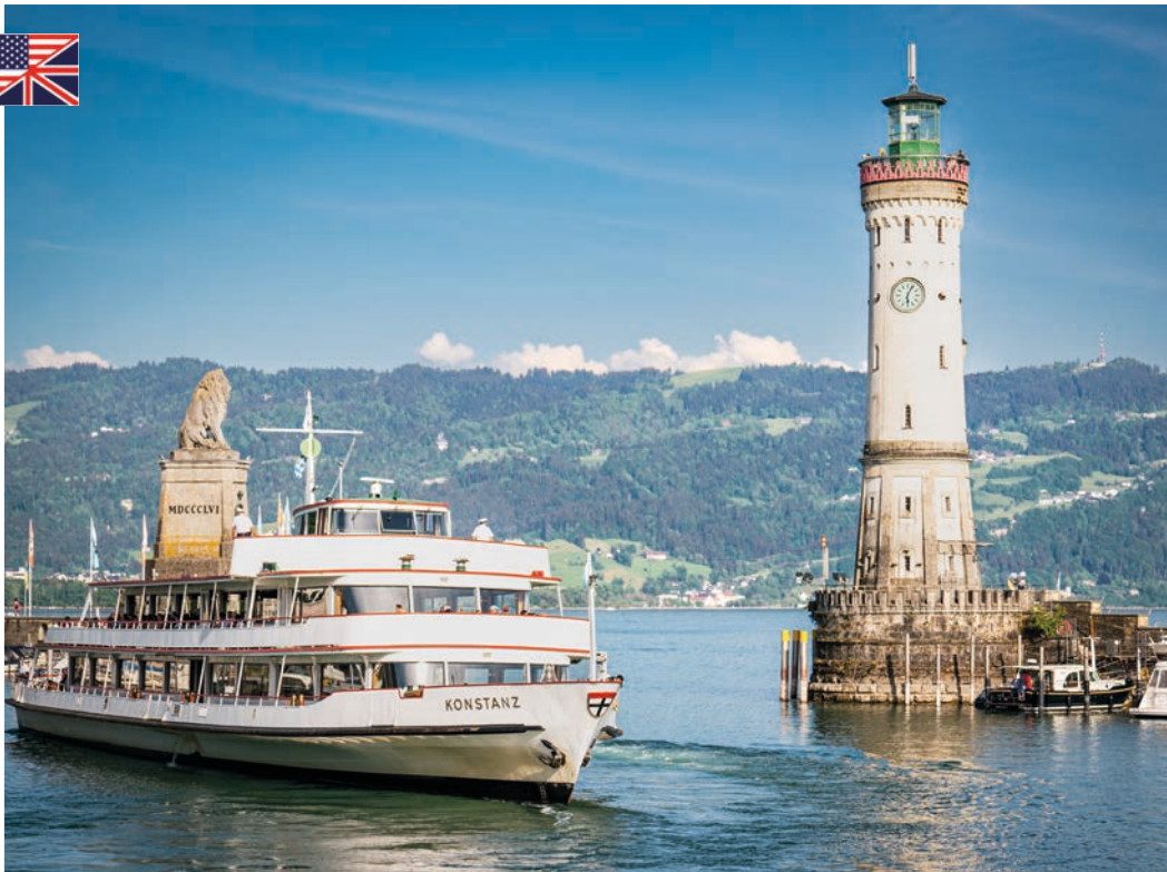
Harbor Lake Constance